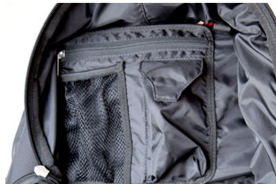
Generously dimensioned back compartment with additional inside pockets. Großzügig dimensioniertes Rückenfach mit zusätzlichen Innenfächern.