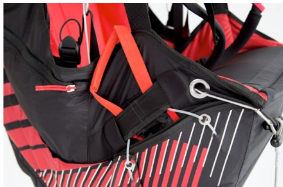
Easypull rescue container with ergonomic release handle. Easypull Rettungscontainer mit ergonomischem Auslösegriff.